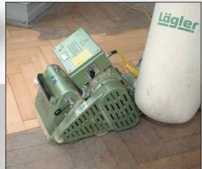
Figure 1: Find any mistakes.