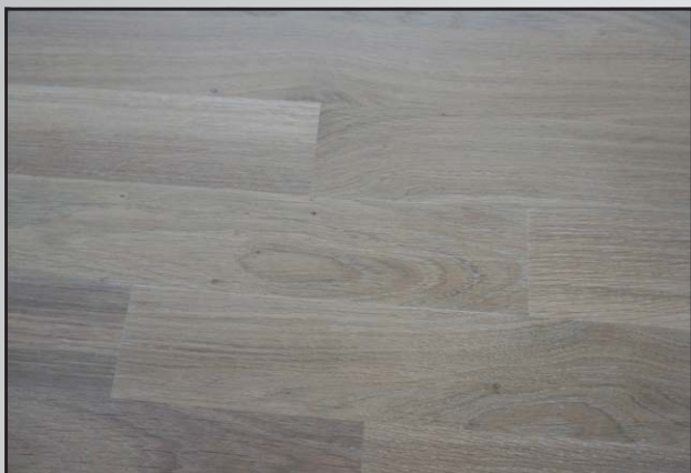
Pic. 8 Surface after the first cut with the TRIO at 100 grit.