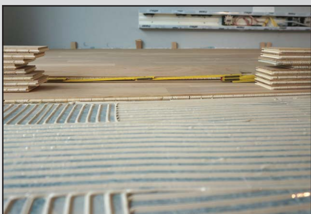
Pic. 7 Bonding of the two-layer engineered oak floor.

The bonding was performed with a very low-emission, solid-elastic, silane-modified polymer adhesive (GISCODE: RS 10, EMICODE: EC 1 PLUS R) from the same manufacturer as the primer.