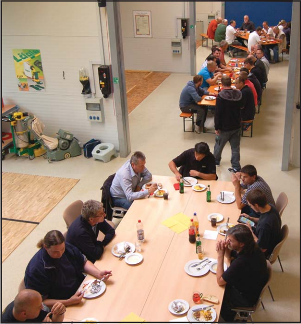
Pic. 17 Our „champions“: LÄGLER® employees and „alumnus“ at this years´ summer party.