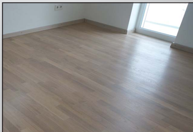
Pic. 11 After applying the color oil using a buffer and a beige pad.

For the initial treatment, the wooden surfaces pretreated with oxidative hardening oil, a white pigmented oil was used on top. The application was done using a trowel. The color oil was easy to apply and to buff in fast using the SINGLE and a beige pad.