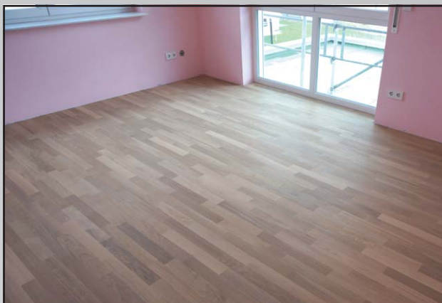
Pic. 12 Nursery after the installation.