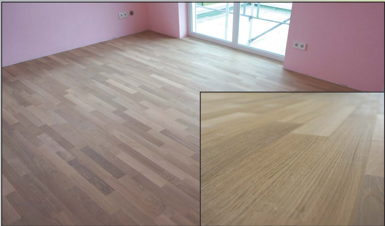
Pic. 1 Two-layer engineered wood flooring before the sanding (Nursery).

More and more craftsmen are installing high quality two-layer engineered wood flooring, because there is an increase in demand by the customers. However, its thin wear layer can cause problems when sanding.