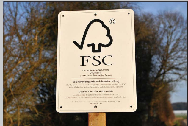
Pic. 2 The costumers demands more and more sustainable products.

Pre-oiled two-layer engineered wood flooring is slightly more expensive, but brings advantages in handling and sanding.