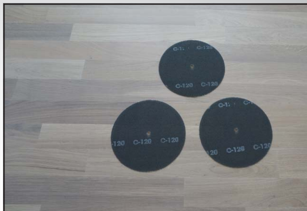
Pic. 9 Fine surface after the last sanding cut with the TRIO at 120 grit screen.

A high-quality two-layer engineered wood flooring and a professional install led to low (small) height differences of the single strips at a maximum of 0,3 mm / 0.012 in. Due to that it was possible to start with the TRIO at a 100 grit according to the PST® (Pic. 3).