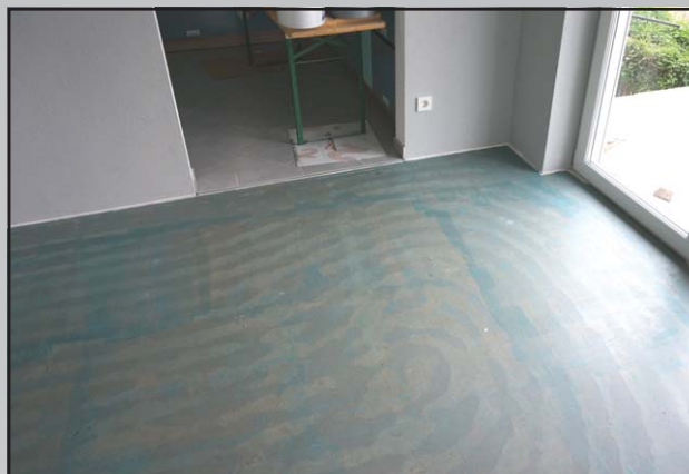
Pic. 6 Primer for better adhesion.