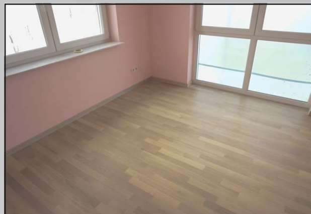
Pic. 13 Wooden surface after applying the color oil.

The white pigmented oil increases the contrast of the grain and creates depth. This led, in this case, to a lively and warm tone and a high-quality wooden surface.