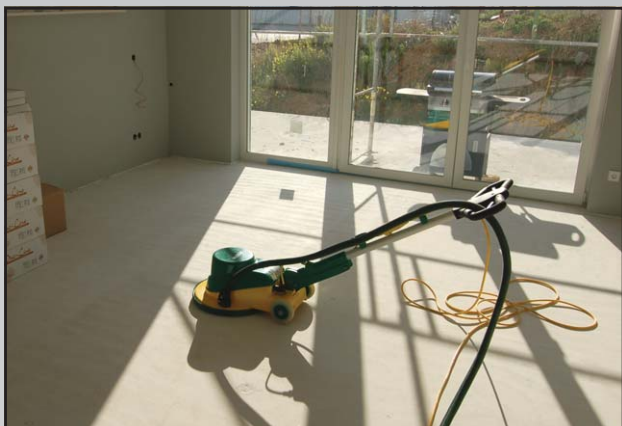
Pic. 5 SINGLE light sanding of the subfloor.