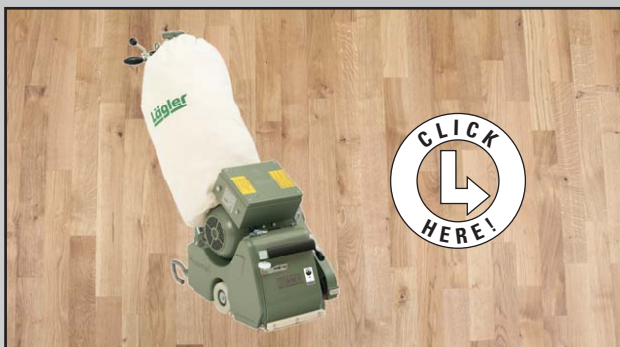
Pic. 11 Link to the HUMMEL®-details.