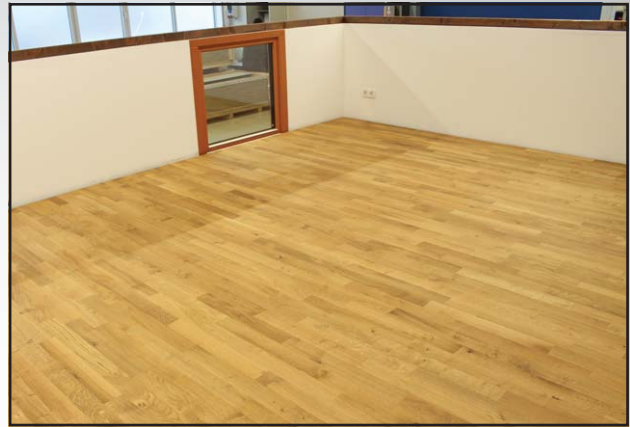
Pic. 4 White oak strip flooring on a wooden sub-structure.

Another challenge was the installation of strip flooring on a vibrating/bouncing sub-structure. The floor was finished with natural oil.