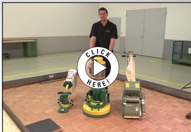
Pic. 9 Course of action of the beech floor.

Click Pic. 9, to see the sanding video of the beech floor.