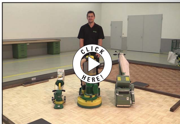
Pic. 10 Course of action of the maple floor.

Click Pic. 10, to see the sanding video of the maple floor.