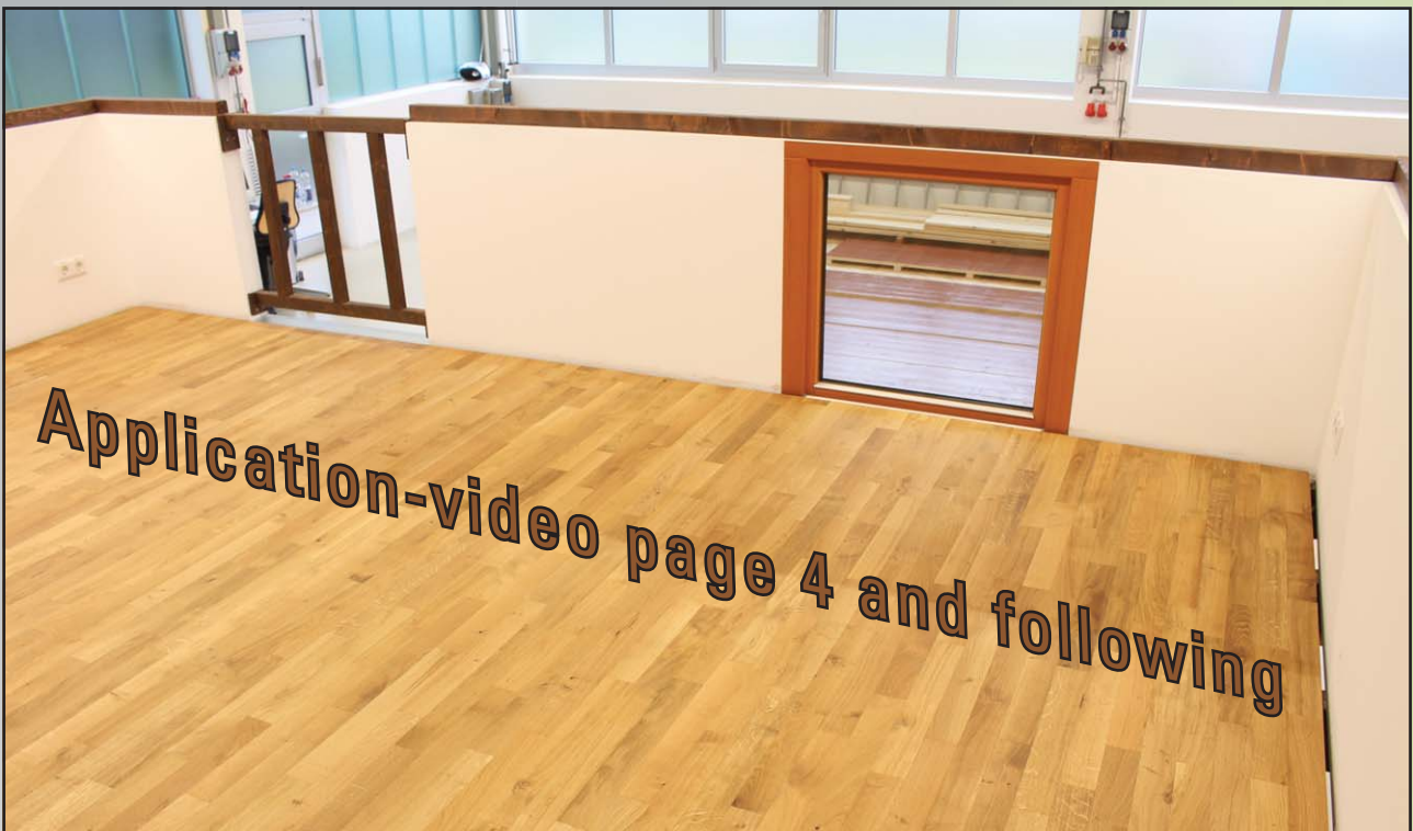
Pic. 1 Test surface; white oak strip flooring installed on plywood over sleepers before the re-sand. The subfloor and flooring were installed per NWFA Guidelines.

The sanding of different species of wood creates a challenge for the craftsman. It's extremely important to use the best sequence of machines, sand paper and application.