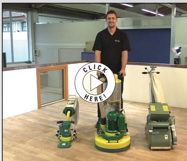
Pic. 8 Sanding of the oak floor.

Compared to the standard sanding method with the HUMMEL® using grit sequence grit 36 / 60 / 100 a lot of time was saved by using the PST® on all three floors. By not using grit 36 less sanding marks need to be removed and less abrasion of the wood is caused.