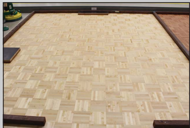
Pic. 6 Maple parquet floor before the re-sand.

To compare the final results we used the same natural oil as finish as on the other floors.