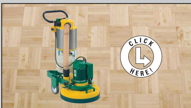
Pic. 12 Link to the TRIO-details.