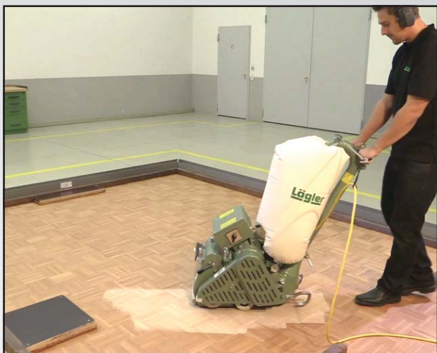
Pic. 3 Perform a test cut if needed.

In addition to the right machines, the use of high quality abrasives is required for a good result. LÄGLER® recommends the use of LÄGLER® zirconia-corundum abrasives.