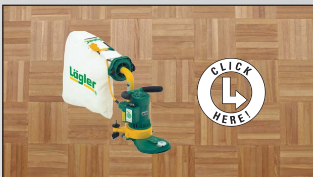
Pic. 13 Link to the FLIP®-details.