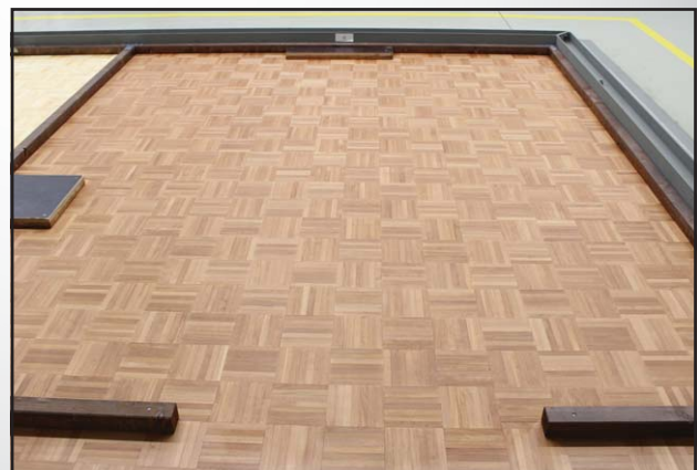
Pic. 5 Beech floor before the re-sand.

The beech floor for our sanding test was flat and natural oil was the finish product.