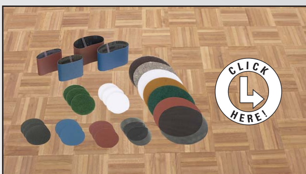
Pic. 14 Link to the LÄGLER® DIREKT 12 / 2012.