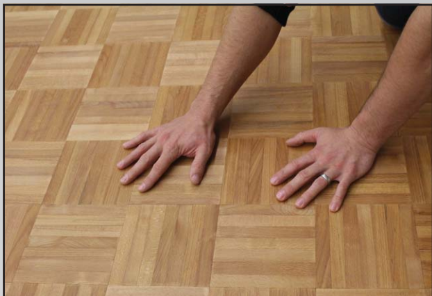
Pic. 2 Check the condition and determine the necessary work steps of the PST®.

The goal of our extensive research was to apply a standard process on many different wood species using the Premium-Sanding-Technology PST®. We show that the same high quality result is achieved on each floor using the same procedure (no matter if it's a new installation or a re-sand).